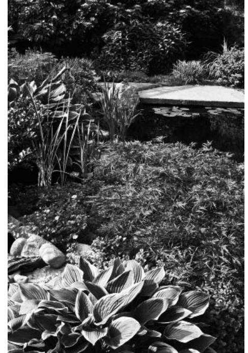
Photographs of gardens from last year’s tour pulse with life.