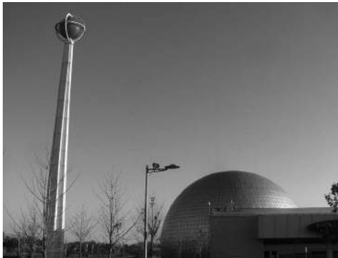
The Basketball Hall of Fame

The library has expanded its museum pass offerings with support from the Friends of Forbes Library, now offering passes to 15 different area attractions. New this year are passes to the Brattleboro Museum & Art Center and the Basketball Hall of Fame in Springfield. The library has reinstated passes to the Boston Museum of Fine Arts, the Norman Rockwell Museum, Stockbridge, and the recently expanded Sterling and Francine Clark Art Institute, Williamstown. All of the passes may be borrowed for two days with a library card except for those for the Boston MFA, which do not need to be returned. Passes offer free or reduced admission price for between one and eight people depending on the pass.