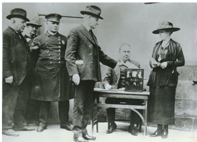
Calvin Coolidge casting his vote in the November 2, 1920 Presidential election in Northampton, MA. Grace Coolidge is on the right. This was her first time voting in a National election.