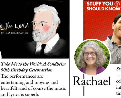
and lyrics is superb.