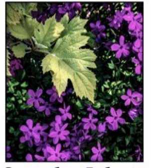
Saturday July 17 10 am to 3 pm