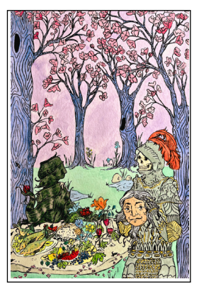
Pamela Acosta Illustration/Paper Arts