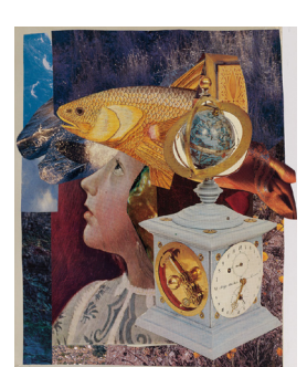
Wendy Woodson Collages