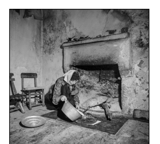
Stan Sherer Retrospective (photography)