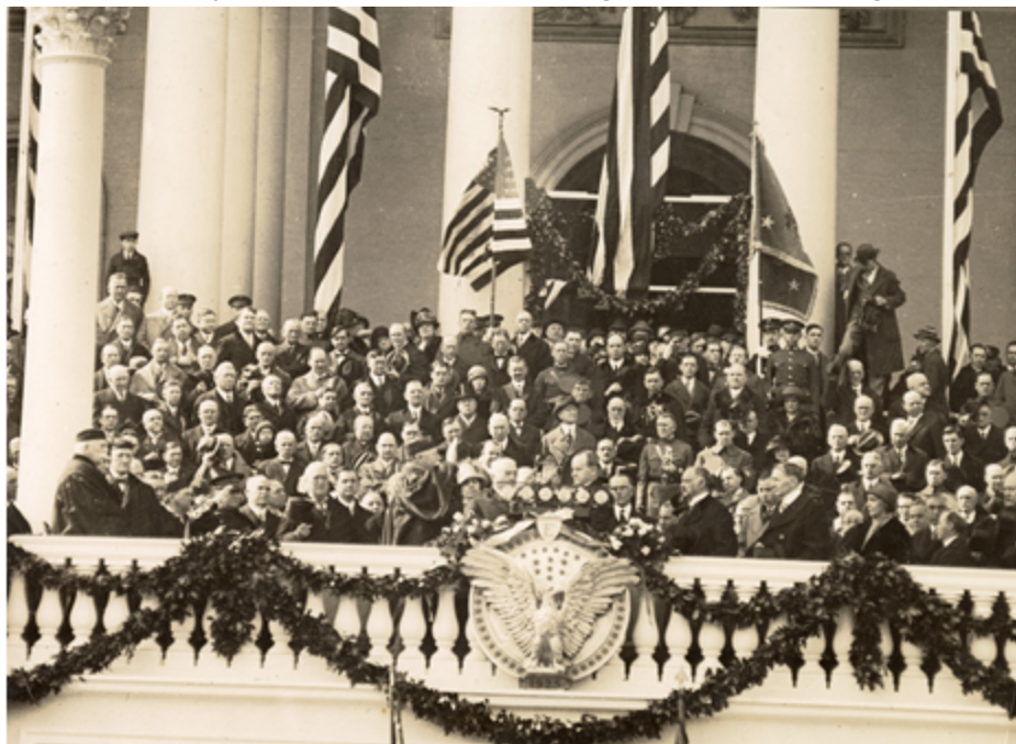
Supreme Court Justice and former President William Howard Taft administered the oath to Calvin Coolidge, March 4, 1925 at the White House

Join us for Centennial Giving Day on March 4 in honor of the 100th anniversary of President Coolidge's 1925 inauguration.